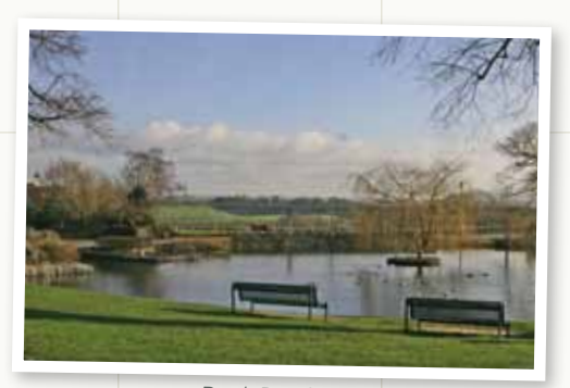
Duck Pond, Hicks Common Road