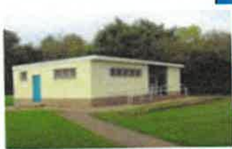
Sports Pavilion, Bromley Heath Park off Queensholm Crescent

fields; there is a set of steep steps and 8 stiles. It is not suitable for pushchairs, wheelchairs, or people who use mobility aids and can be very muddy and slippery when wet.